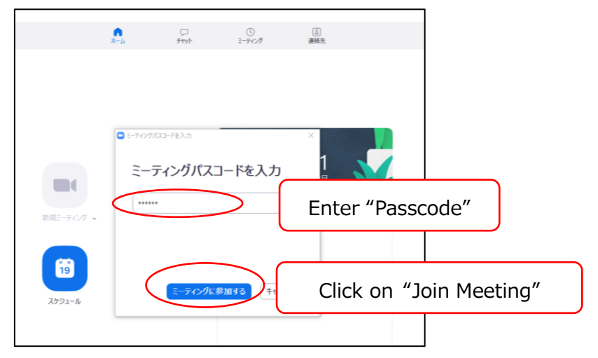
Figure 3 Entry of "Passcode."

Enter the "Meeting Passcode" and click "Join Meeting" (Figure 3).