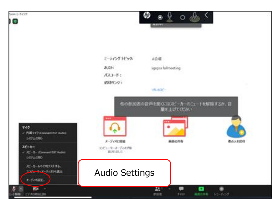
Figure 7 Audio Settings

Settings" to check the speaker and microphone settings (Figure 8 and Figure 9).