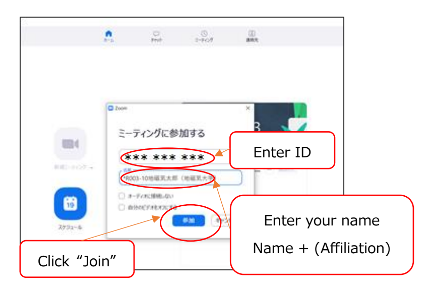
Figure 2 Input ID and name.